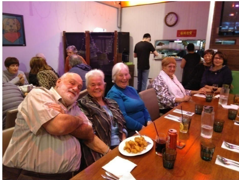
Dine Out 2021 in Keilor Road Niddrie. No reason not to enjoy the night.

Bookings must be made at least 3 days prior. If you don't book there is a possibility of not having a seat.